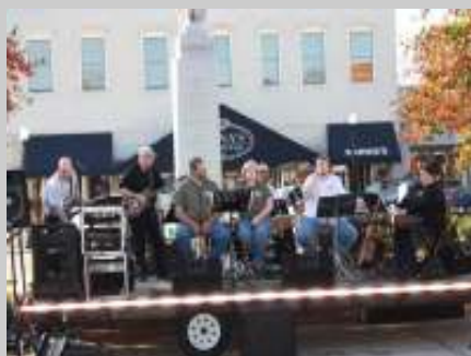
In His Image

Main Street Elberton presents Praise Fest 2010 on Friday, July 23rd from 7-9 pm on the Downtown Elberton Square. Performing will be Lazarus Unwound and In His Image. For more information, call Main Street Elberton at 706-213-3204.